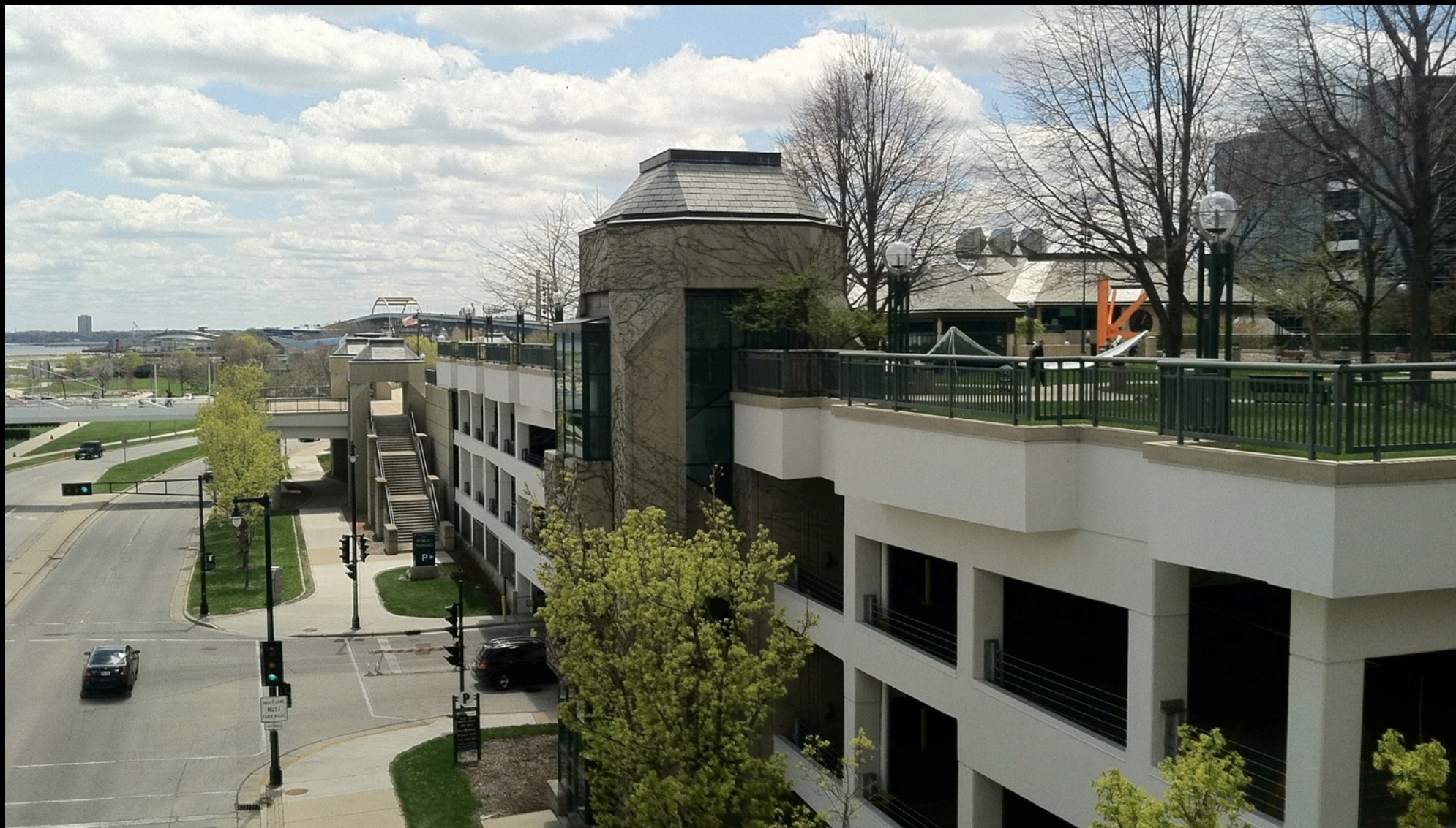
O'Donnell Park today, former site of North Western station.