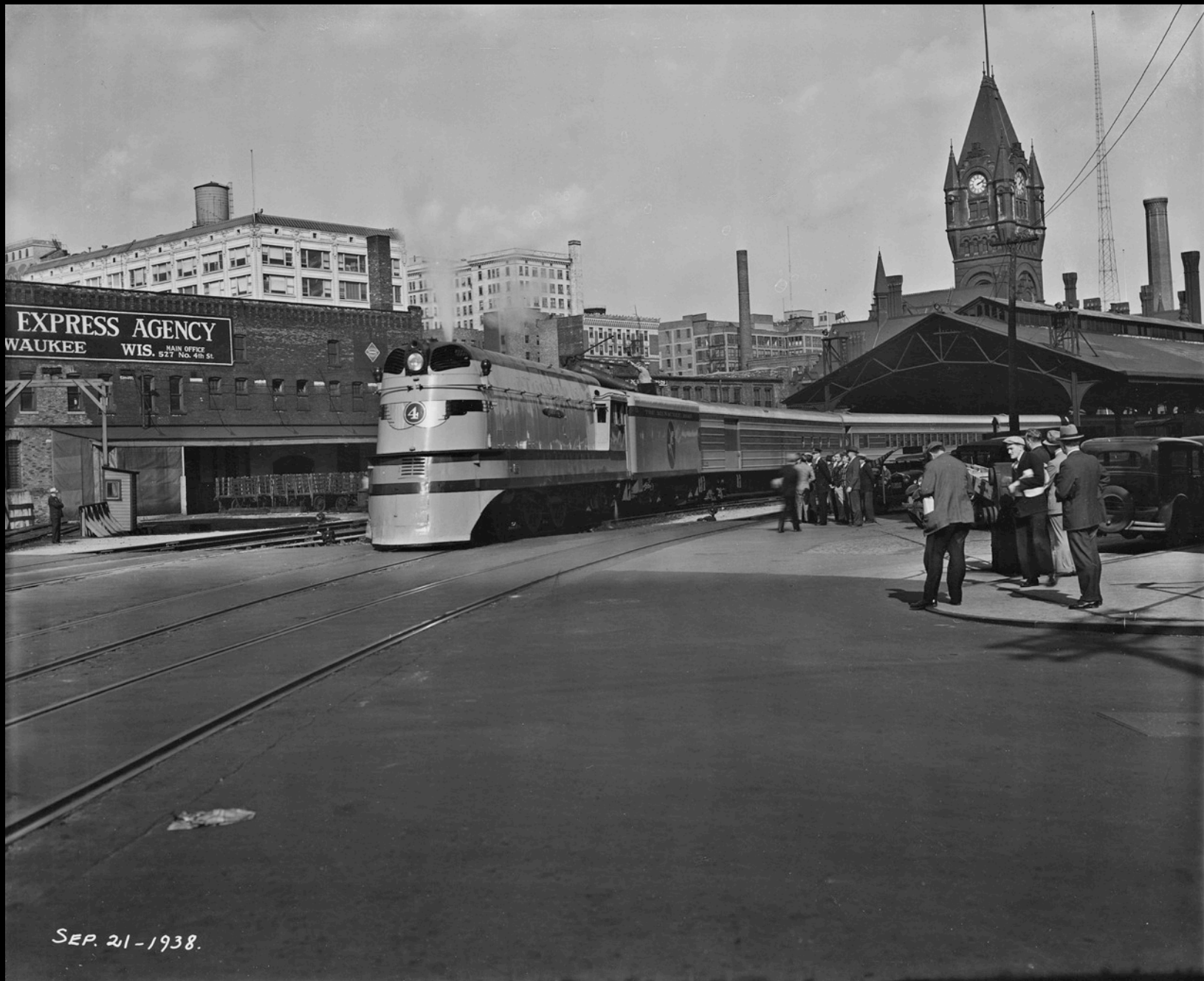
Trainshed of Milwaukee Road depot, from Clybourn Street, on Sept. 21, 1938, during press tour of the “Hiawatha of 1939.”