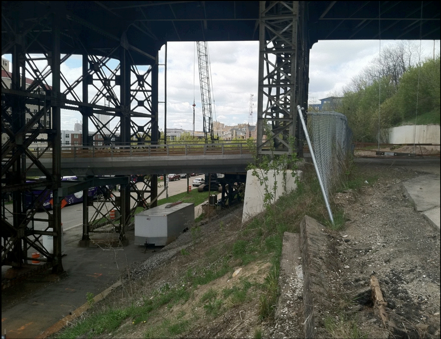
Under the Holton Bridge today, at the north end of the “marsupial bridge.”