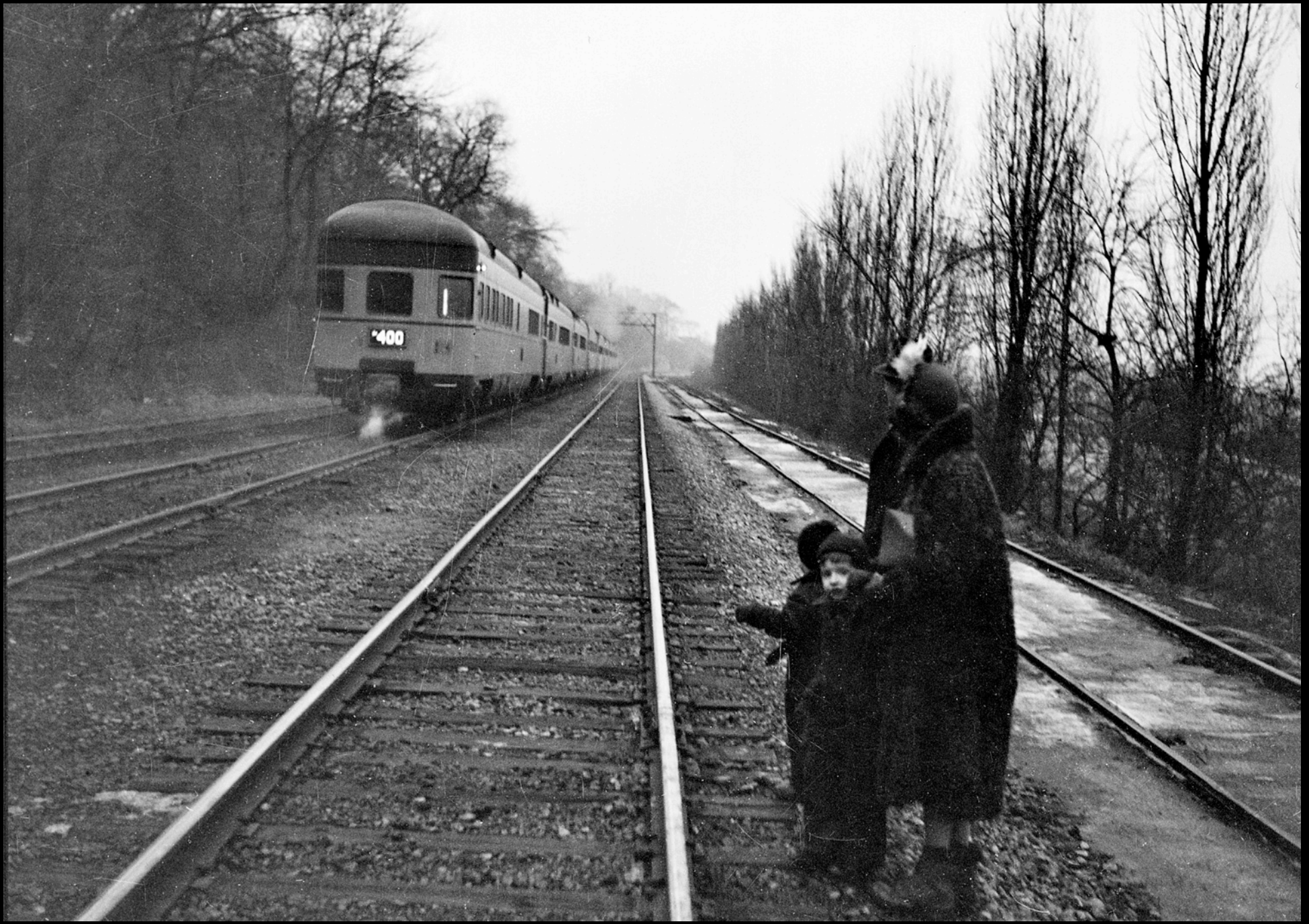
On a winter day in 1940, a family waves to the 400, south of Brady.