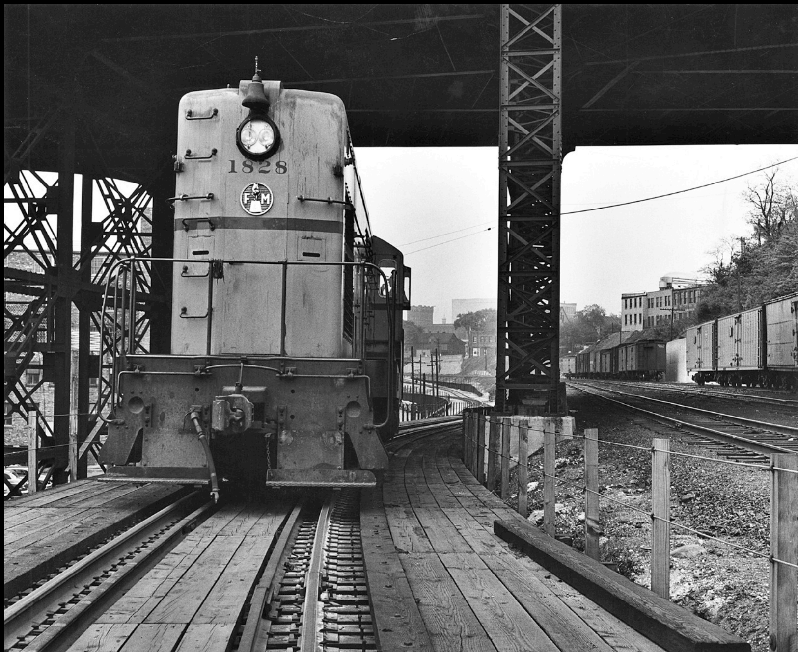
Under Holton Avenue in about 1950. An FM diesel is posed on the ramp track leading up to the Beer Line.