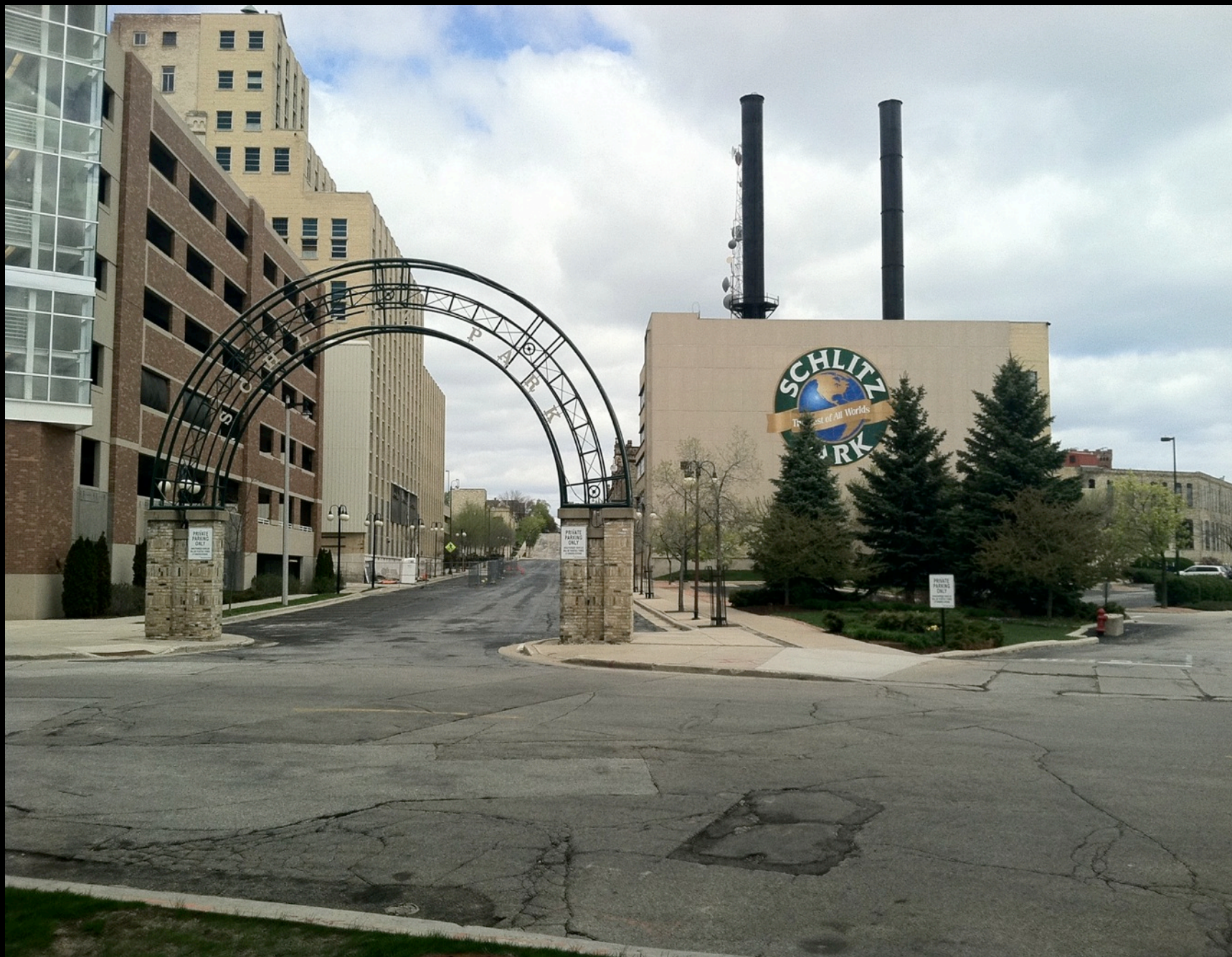
In the heart of today's Schlitz Park, asphalt instead of railroad tracks.