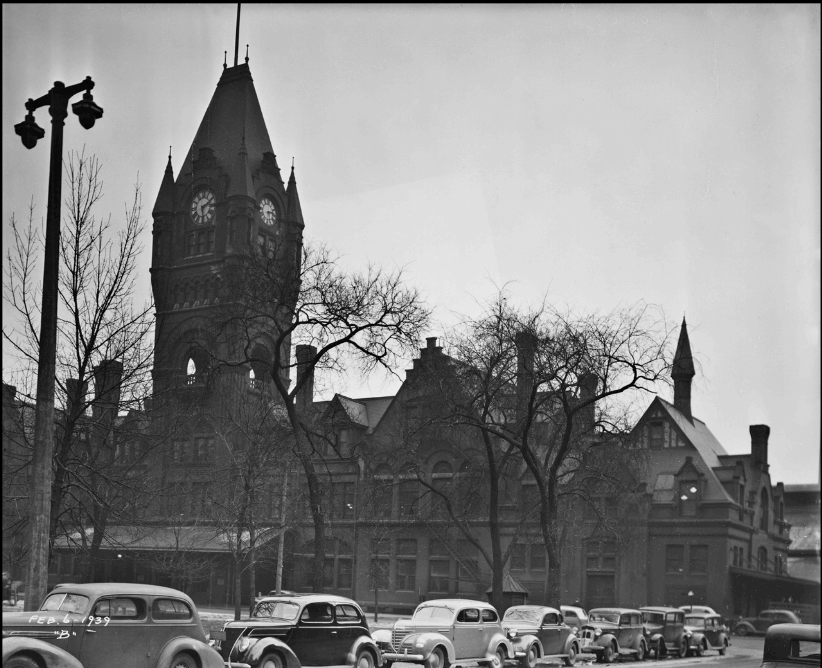
Milwaukee Road depot, overlooking today's Zeidler Park (then known as Fourth Ward Park), Fourth and Michigan Streets. Razed in 1966.