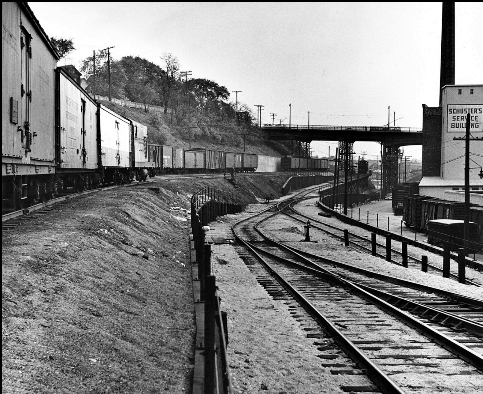
Sometime around 1950: "Ramp track" leading up to the Beer Line near Holton Street. Many of the cars at left are refrigerated "reefers," for delivery of Schlitz and Pabst products.