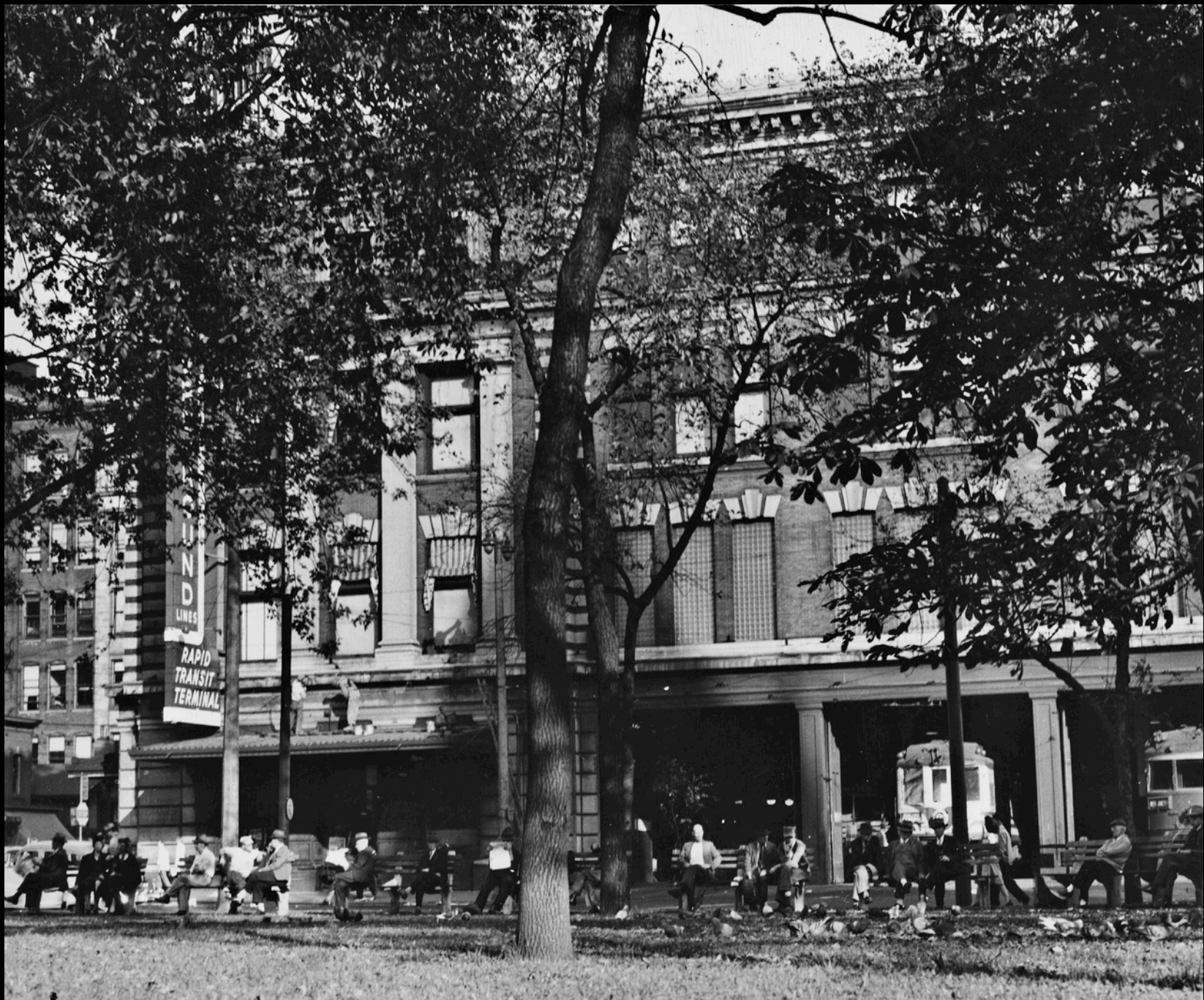
Public Service Building, Third and Michigan, the main terminal of the Milwaukee Electric interurban system.