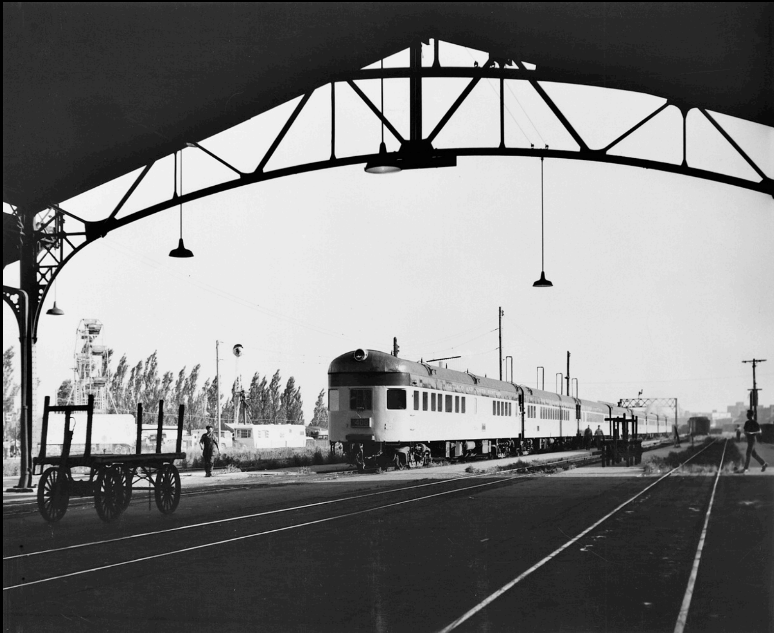
July 23, 1962: The last Twin Cities 400 departs Milwaukee for Chicago, ending all C&NW Chicago-Minneapolis service.