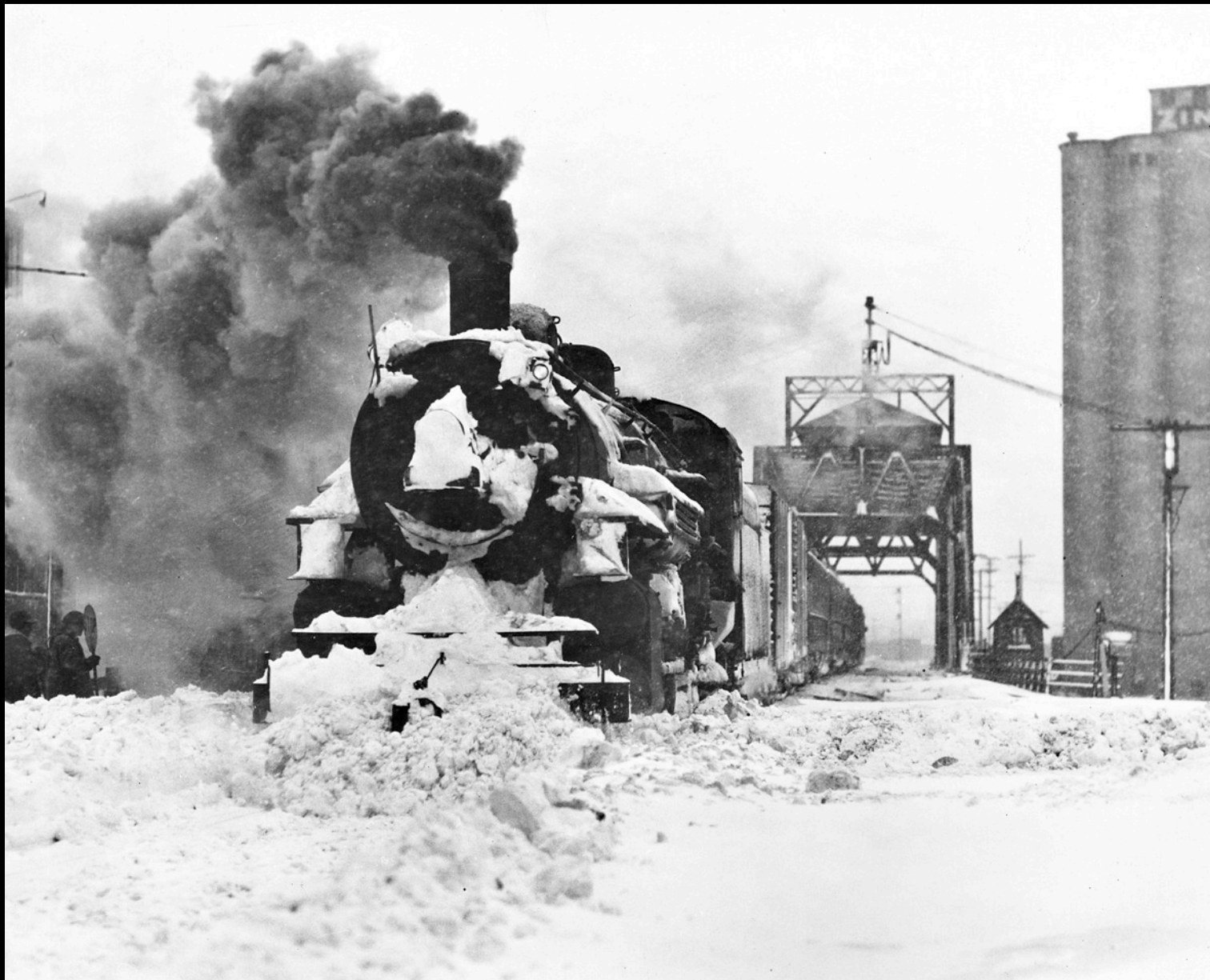
During a blizzard, probably in the 1940s, a steam switcher moves cars across the swing bridge at Erie Street.