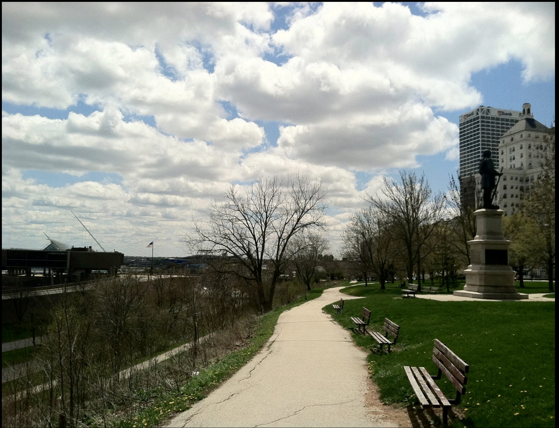
The lakefront today, from a classic vantage point in Juneau Park.