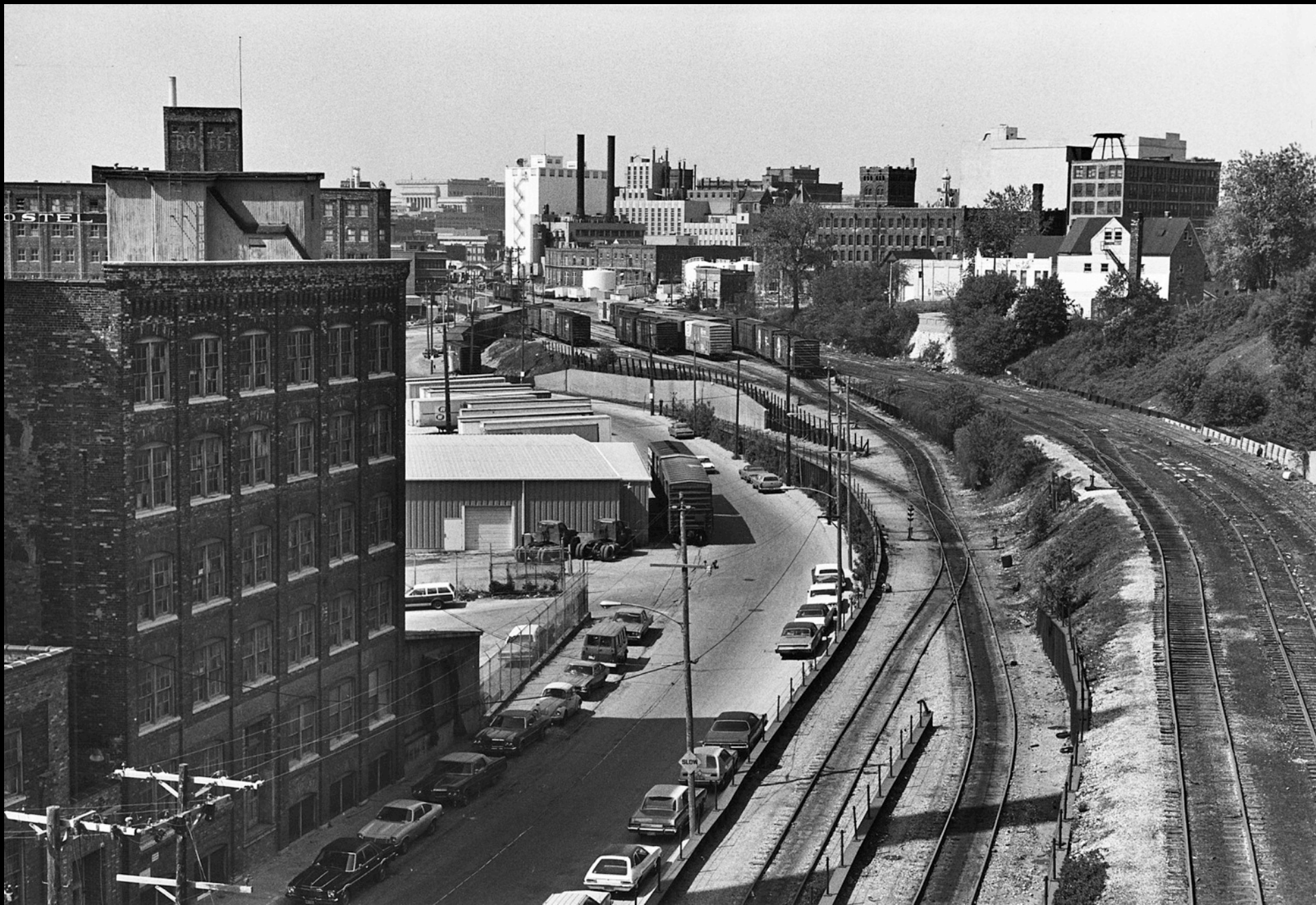
The Milwaukee Road's Beer Line in the mid-1970s, with Schlitz and Mayer Boot & Shoe Company in the distance, and the Trostel Tannery on the left.