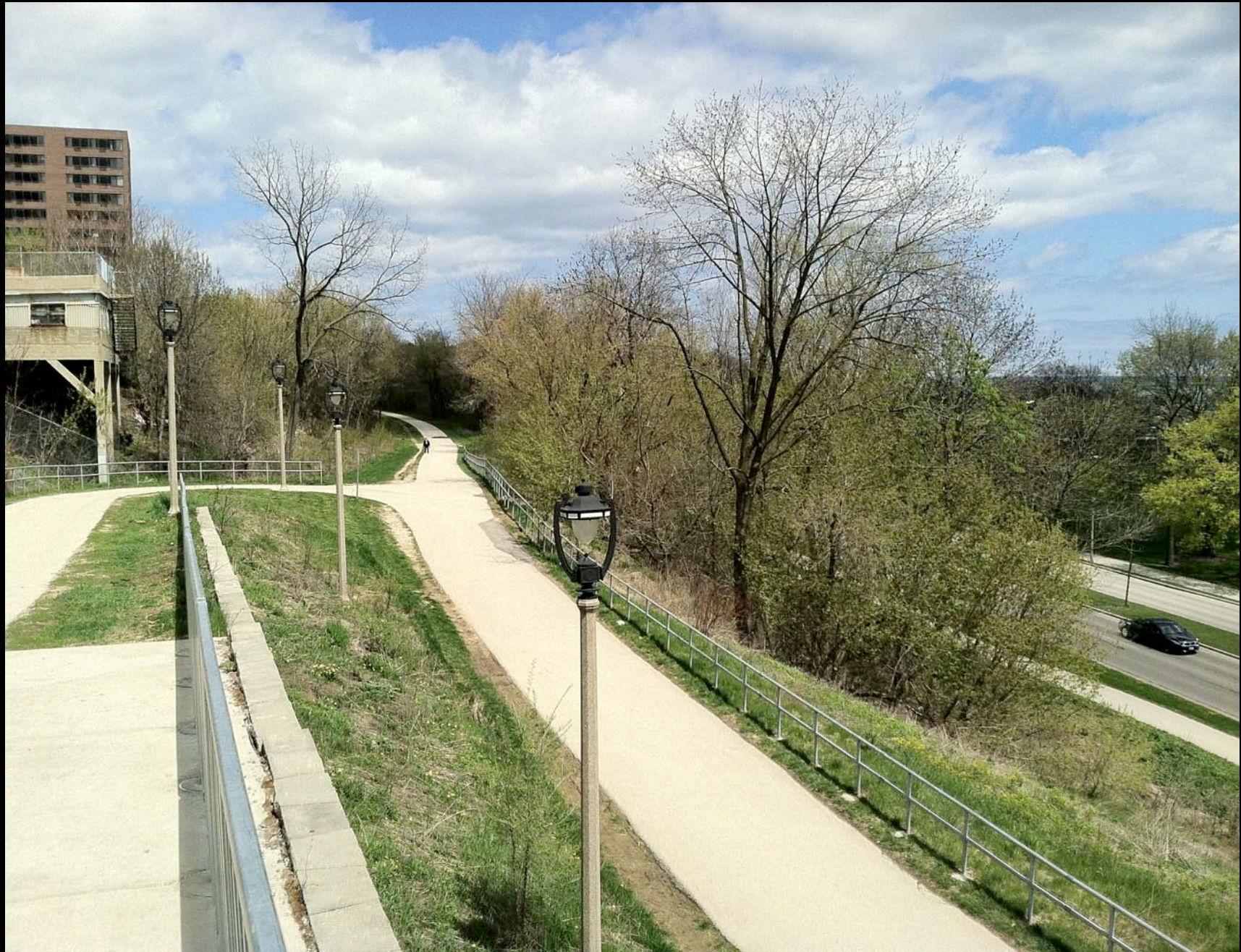
The bike trail as seen today from the Brady Street footpath to the lakefront.