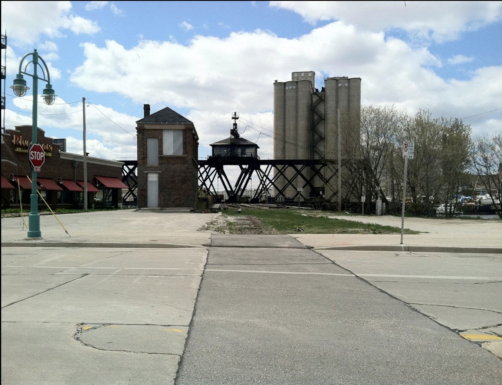
In a view from Erie Street today, the C&NW's defunct swing bridge and tower.