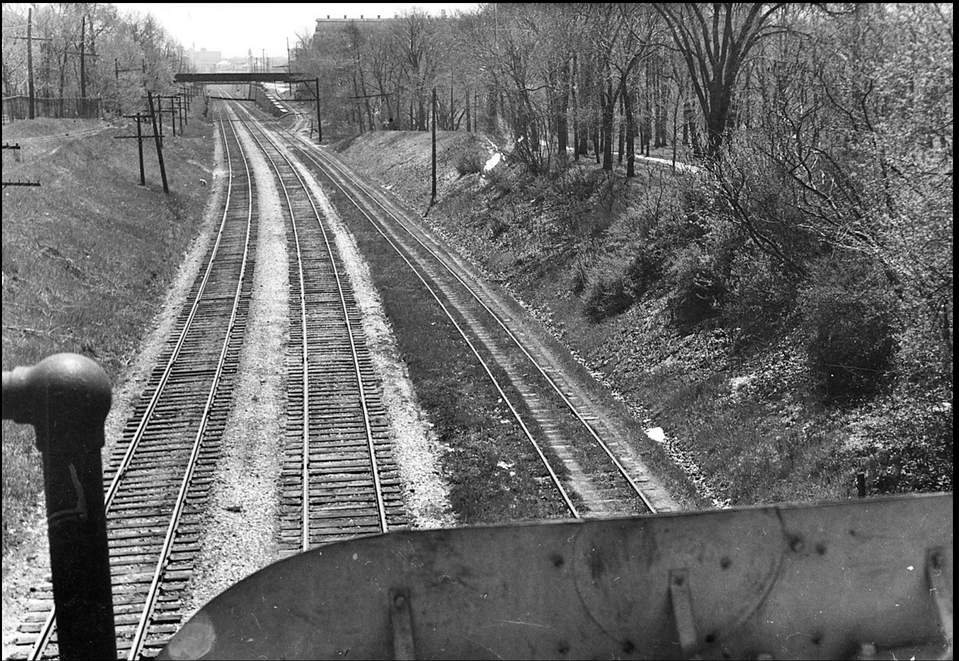
Looking south along the C&NW mainline from the Locust Street bridge, on May 5, 1950. Riverside Park is on the left.