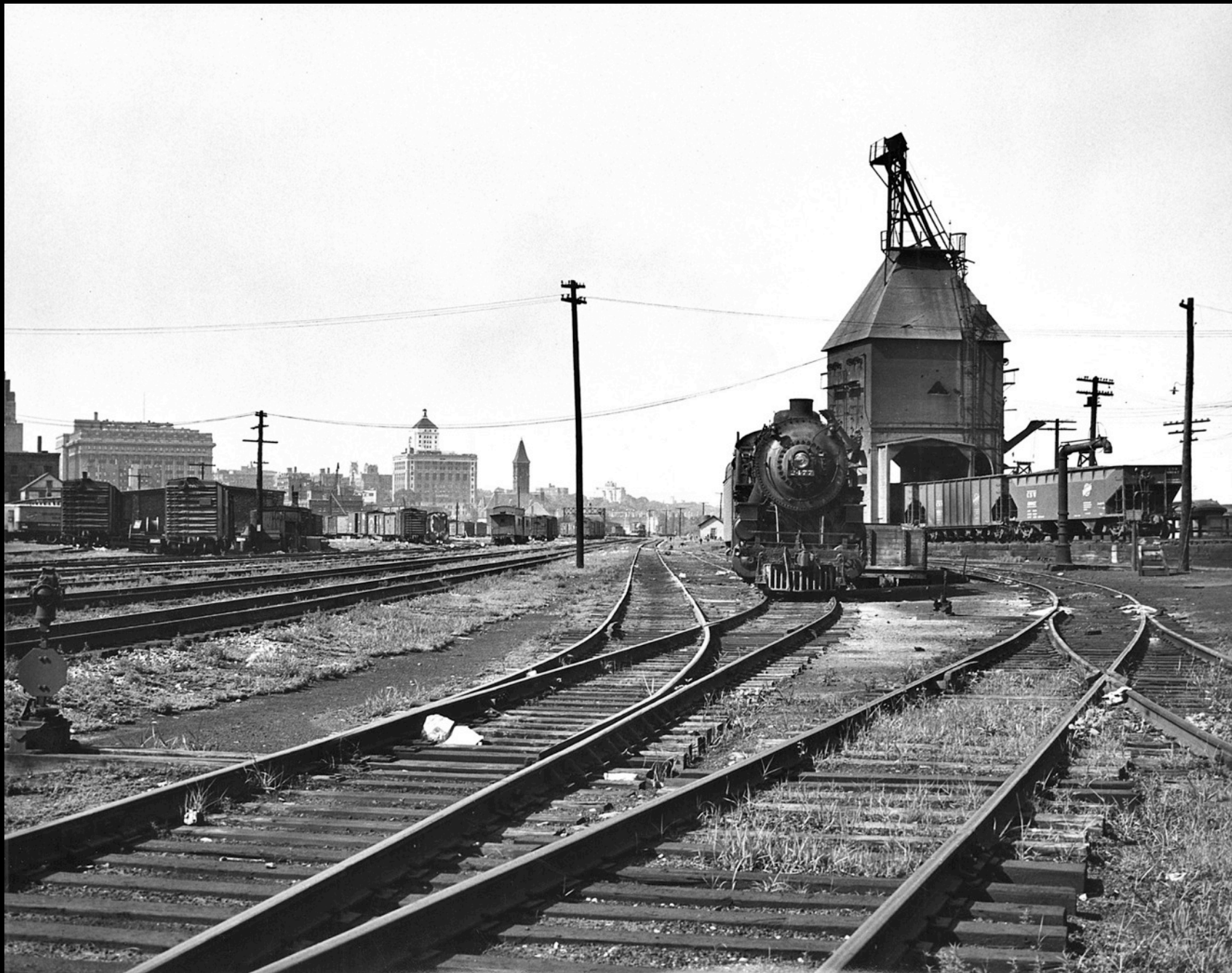
The coachyards in July 1949, coaling tower at right, team tracks for perishables traffic for “commission row” at far left.