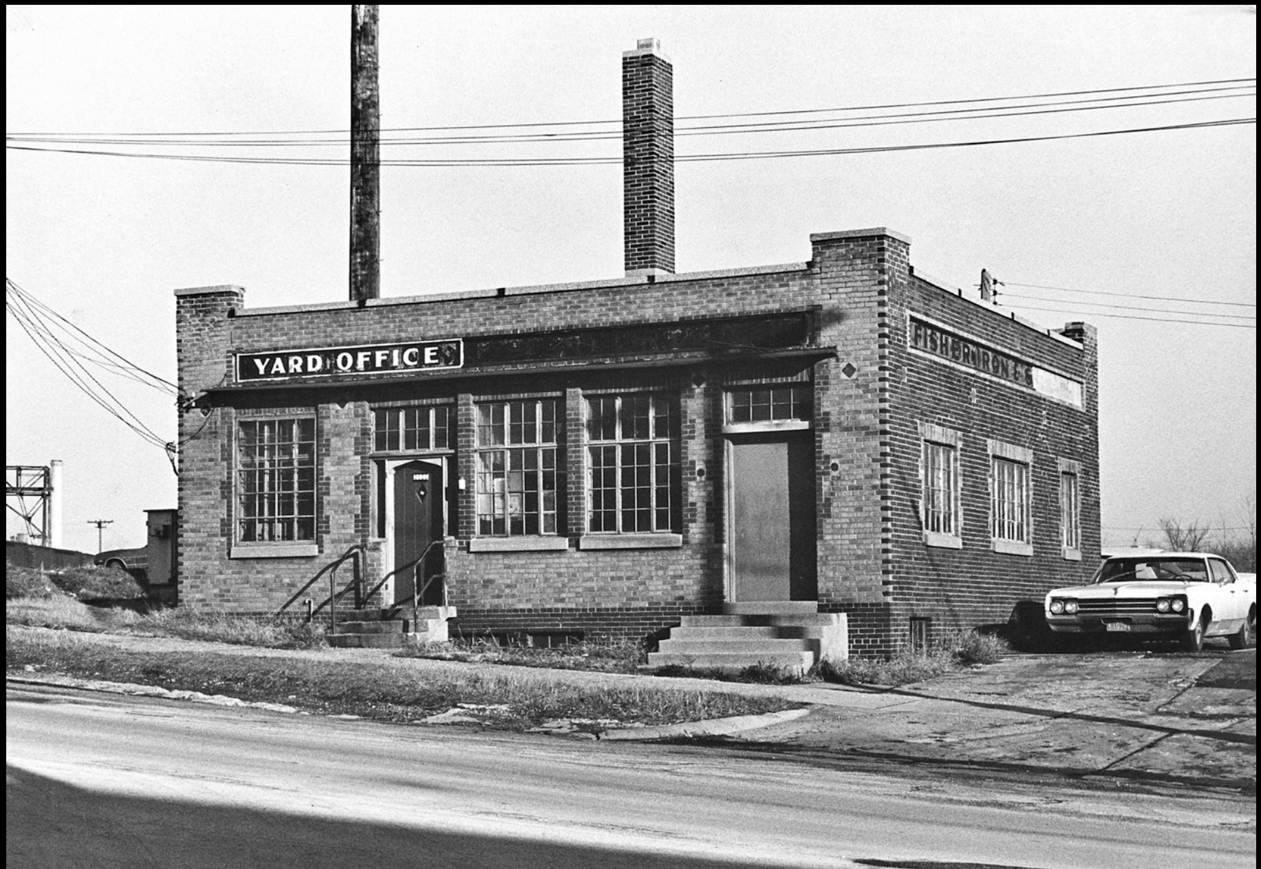
Milwaukee Road's Humboldt Yard office, December 1974.