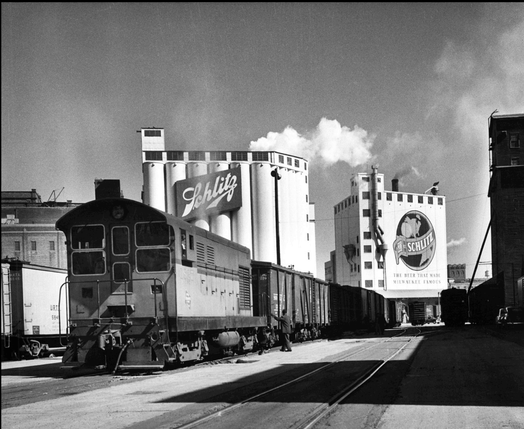
Around 1950, a Milwaukee Road FM diesel switches at Schlitz. At right is the old Wisconsin Electric power plant, now Time-Warner.