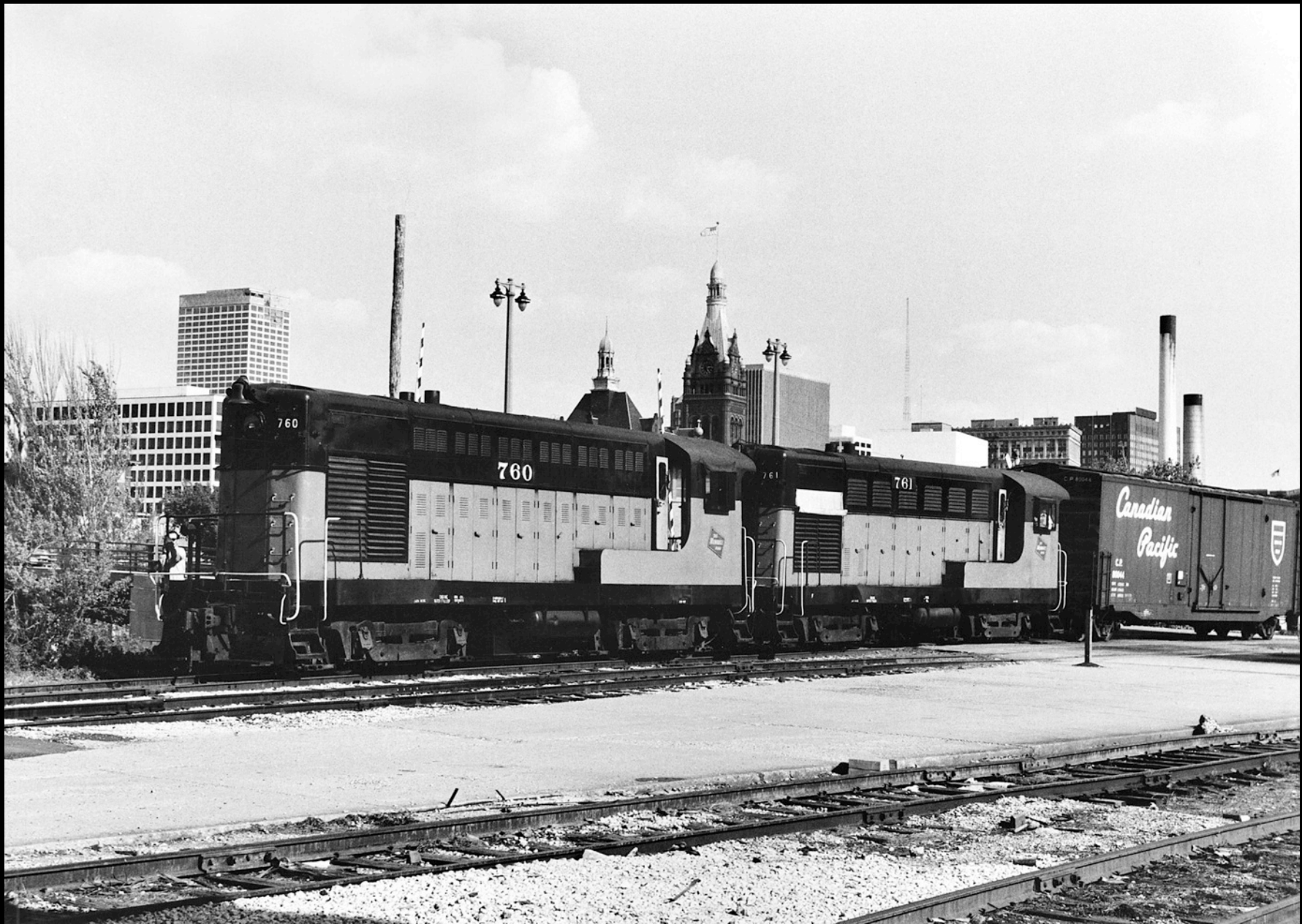
Near the end of the Beer Line at Juneau Avenue, June 1973. A pair of old Fairbanks-Morse diesels delivers newsprint to the Journal warehouse.