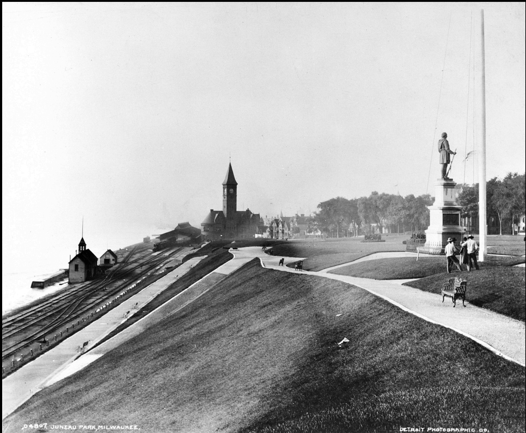
North Western station in 1900, with Solomon Juneau statue at right.