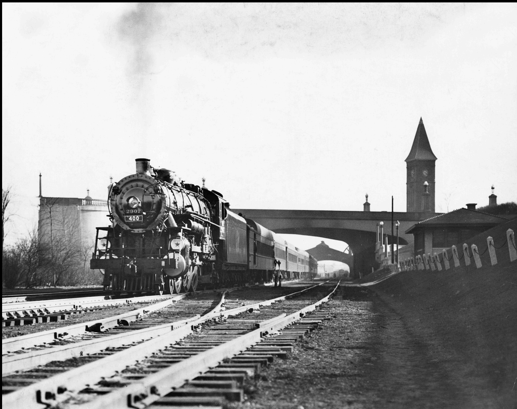
In steam days, likely in the late 1930s, a Pacific-type steam locomotive leads the 400 westbound from the lakefront.