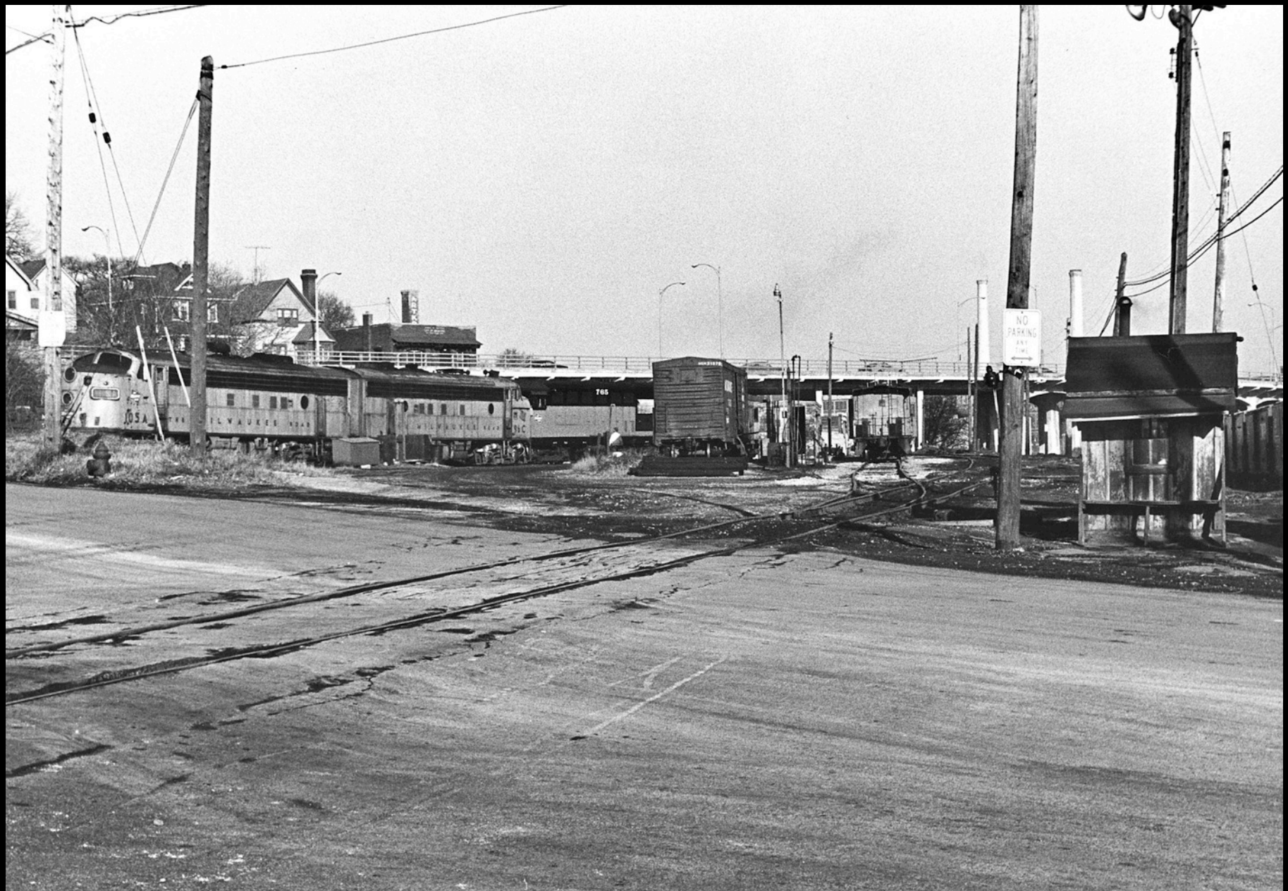
Milwaukee Road's Humboldt Yards in December 1974, not long before they were abandoned. North Avenue bridge in the distance.