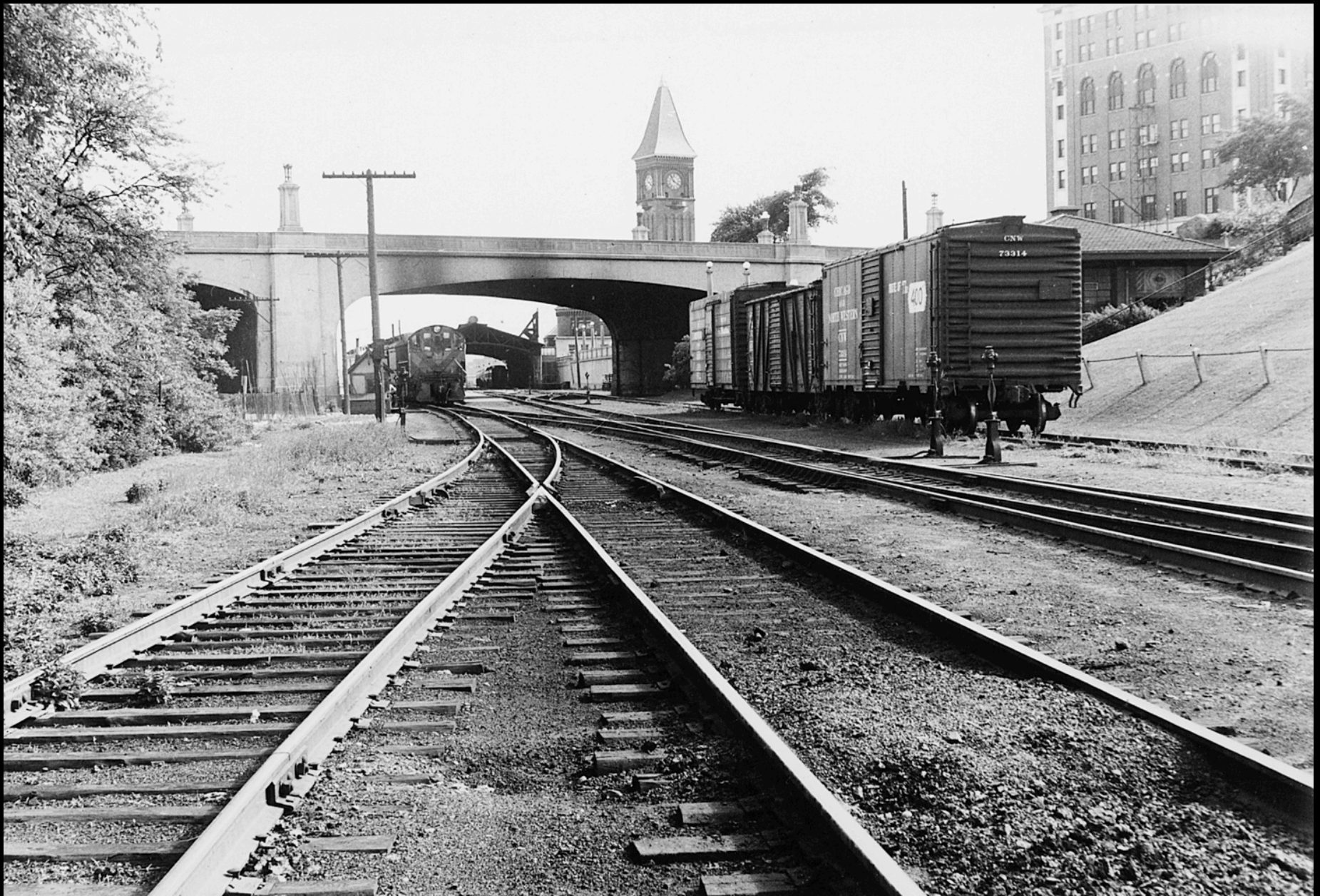
June 24, 1950, 3:45 p.m.: A diesel switcher approaches the photographer while shunting cars below Prospect Avenue.