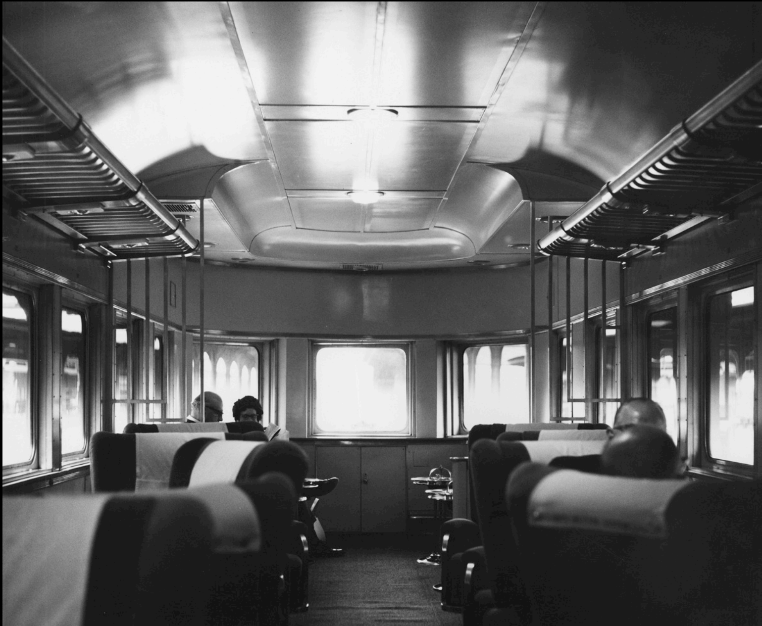
Cozy interior of the Twin Cities 400's observation car.