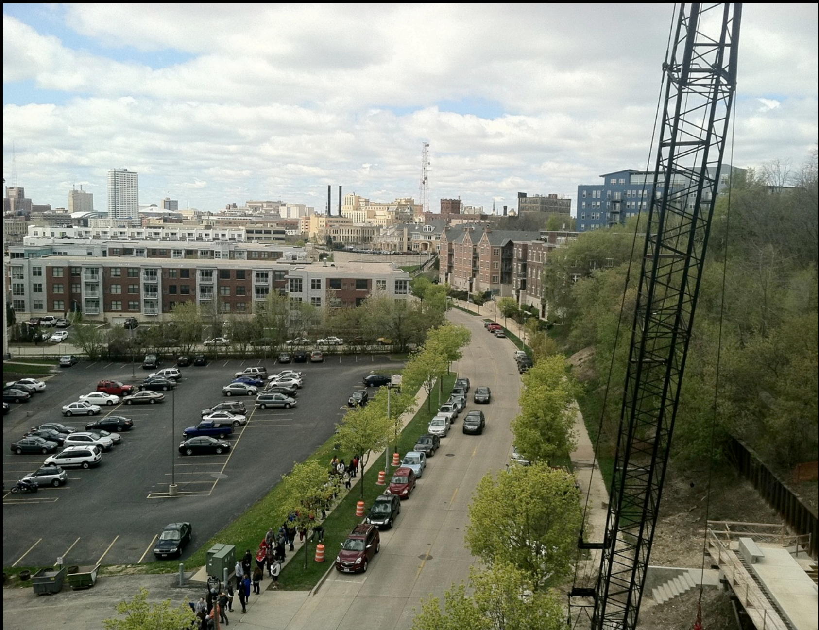
The “Beer Line” today, looking down on the condos and apartments along Commerce Street from the Holton Avenue bridge.