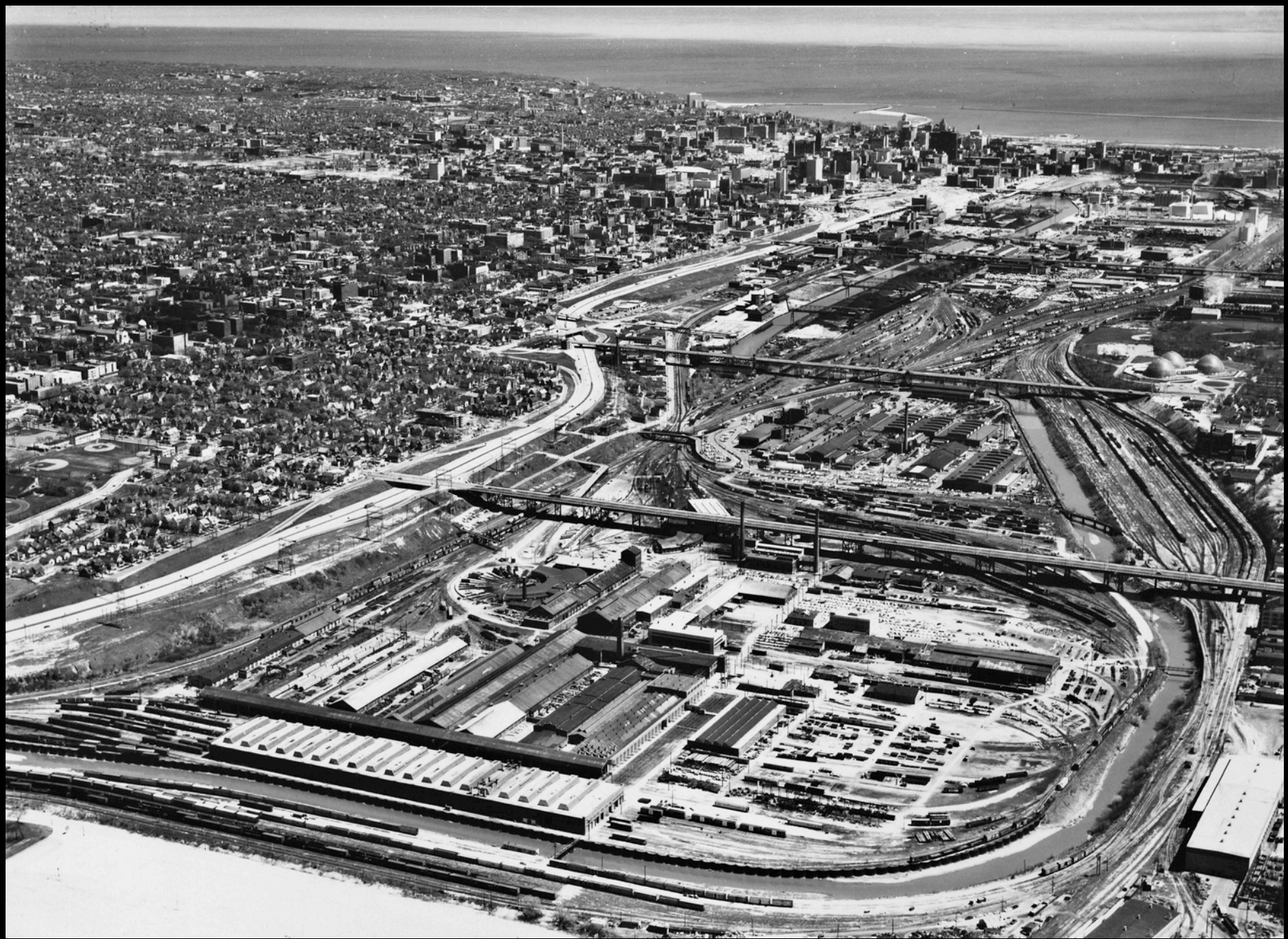
Milwaukee Road's sprawling West Milwaukee Shops in the Valley, circa 1965.